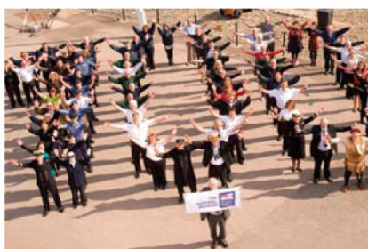
Centenary Birthday Celebration with fun and games