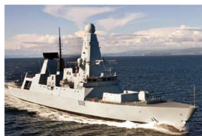
HMS Daring & HMS Gloucester open to the public

PLUS! Music from Band of HM Royal Marines (Sunday only) and RN Volunteer Band HMS Nelson, and Field Gun Displays in aid of Working Age Parkinsons